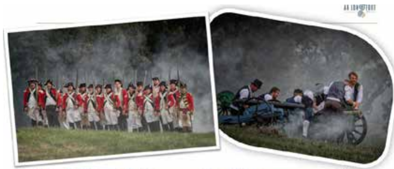
The Battle of Ballinamuck 225th Commemoration supported by the Fáilte Ireland Regional Festival & Participative Events Fund in 2023

For details on eligibility and how you can apply, see www.longford.ie .